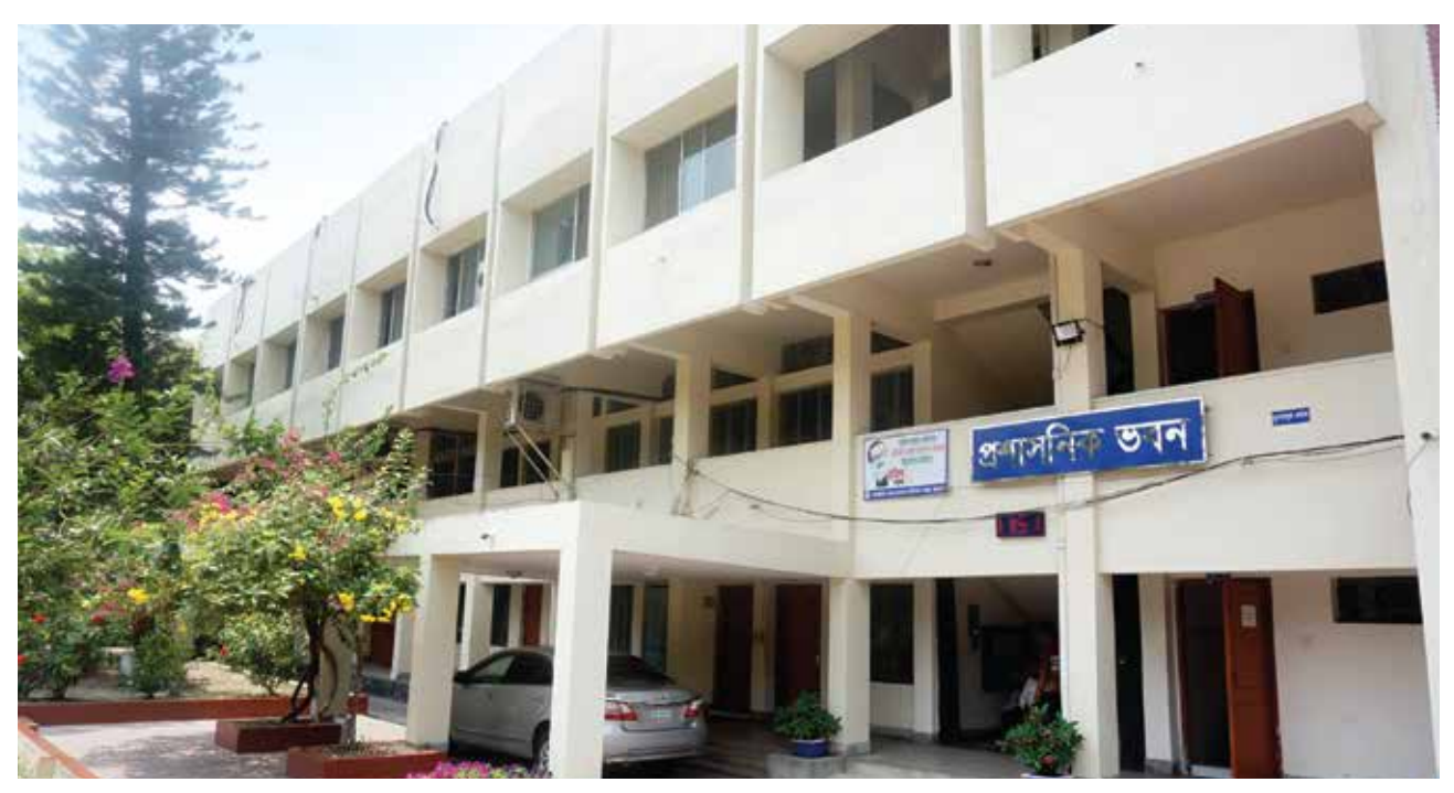
Premises of Regional Public Administration Training Centre, Khulna