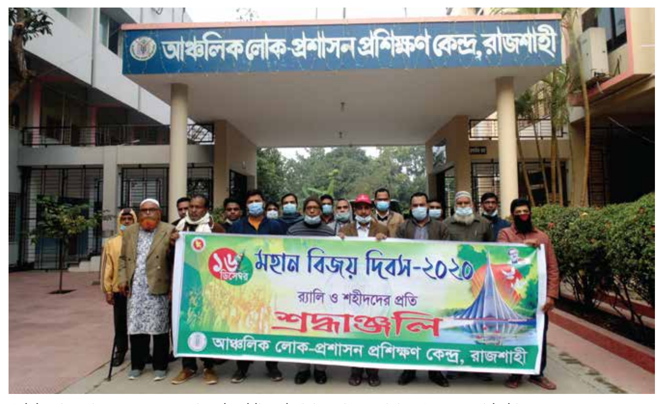
Celebrating Victory Day at Regional Public Administration Training Centre, Rajshahi