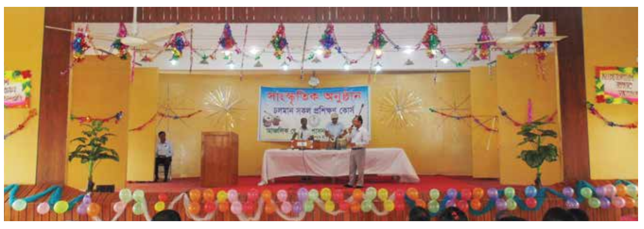
Cultural Programme at Regional Public Administration Training Centre, Rajshahi