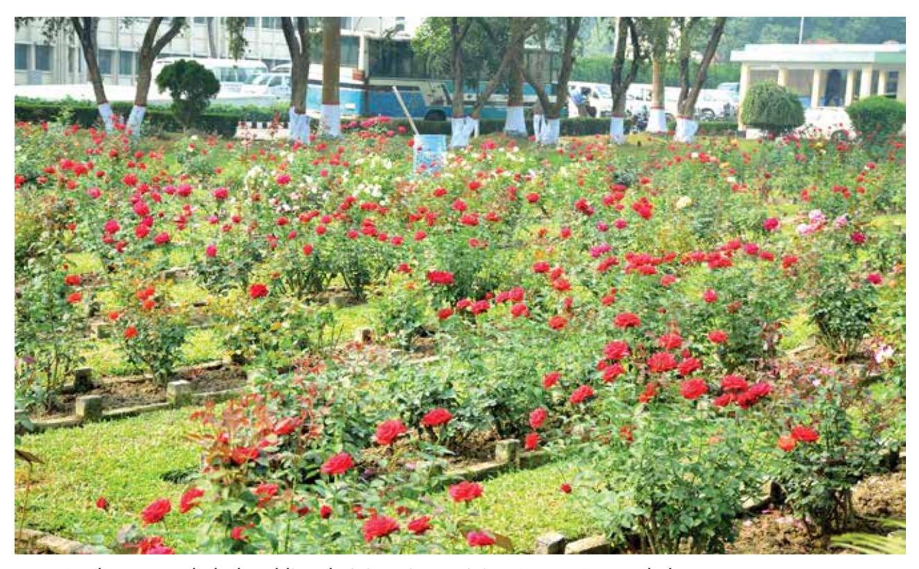
Rose Garden at Bangladesh Public Administration Training Centre, Saver, Dhaka