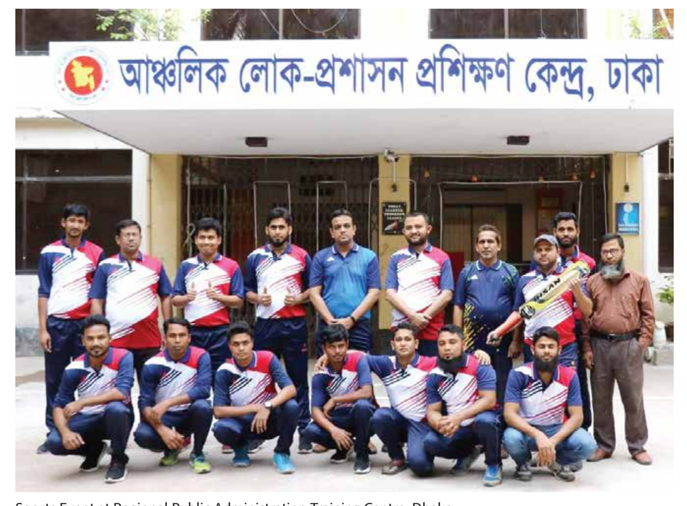
Sports Event at Regional Public Administration Training Centre, Dhaka