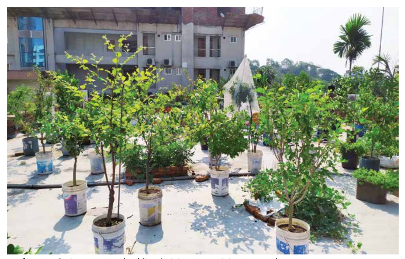
Roof Top Gardening at Regional Public Administration Training Centre, Chattagram