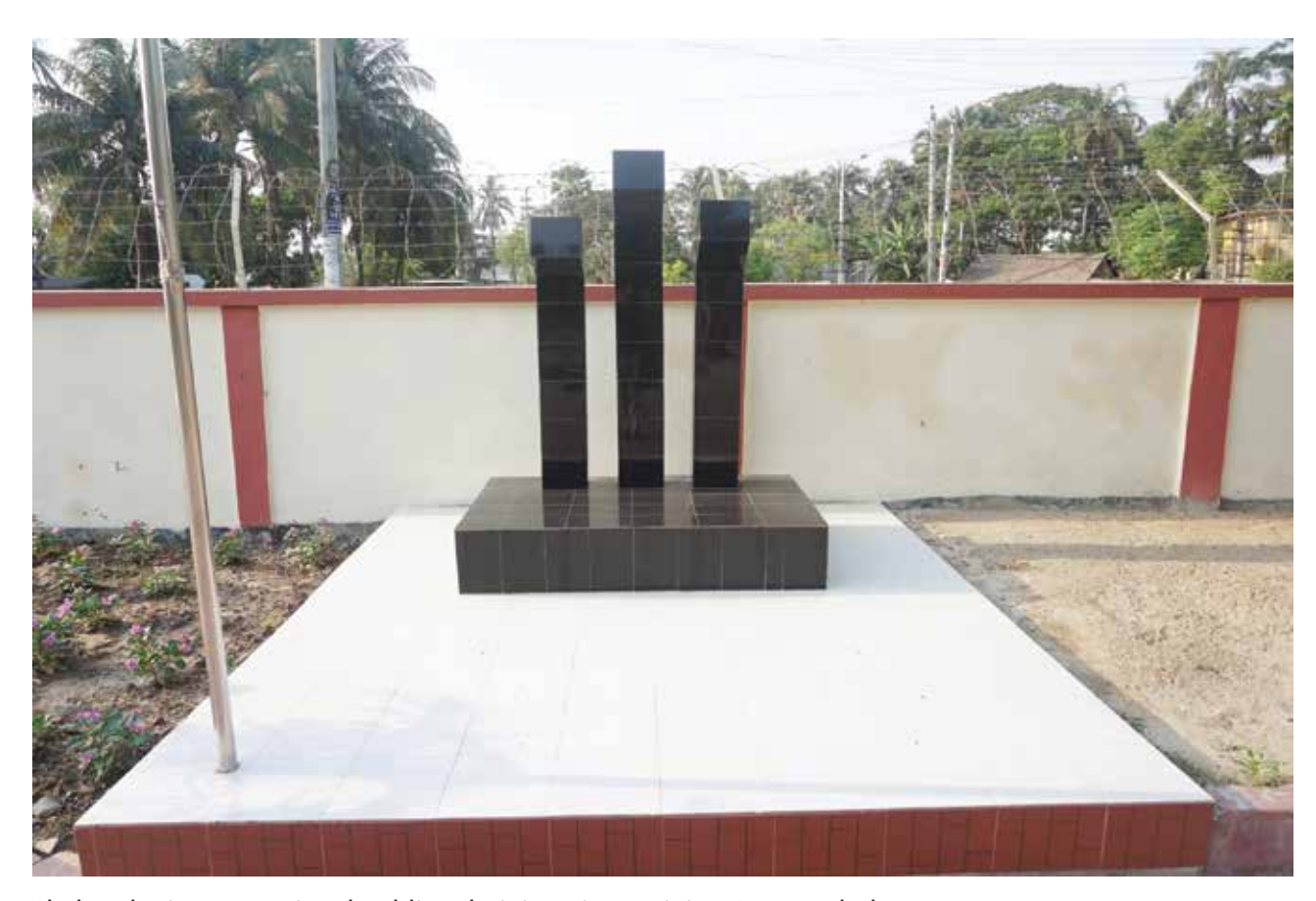
Shaheed Minar at Regional Public Administration Training Centre, Khulna