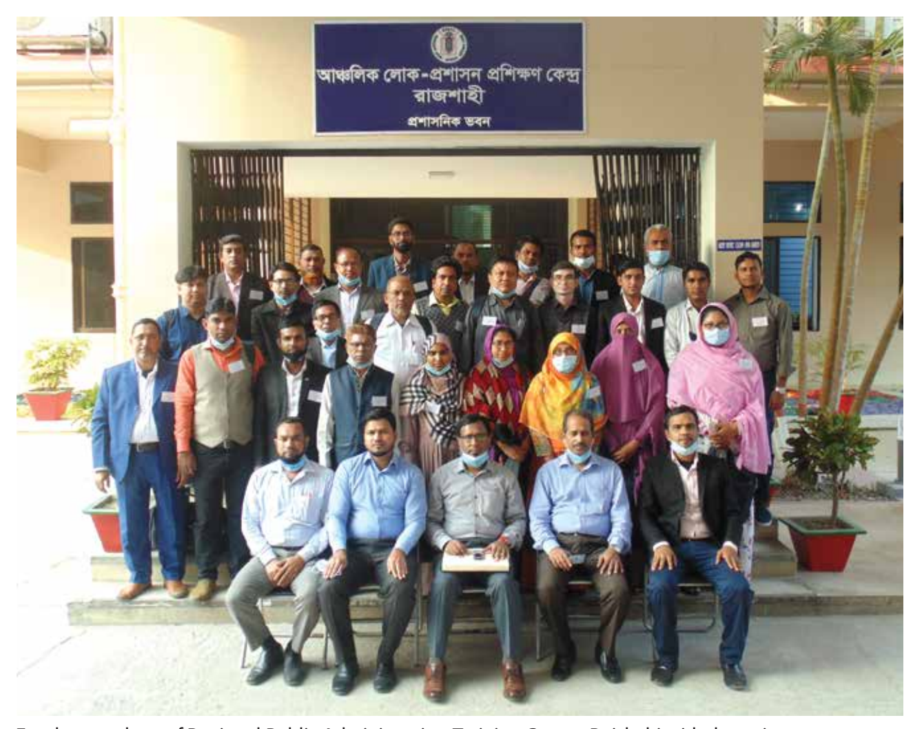
Faculty members of Regional Public Administration Training Centre, Rajshahi with the trainees