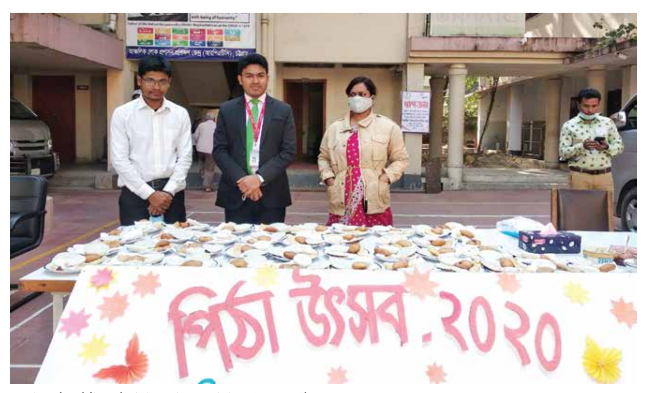
Regional Public Administration Training Centre, Chattagram