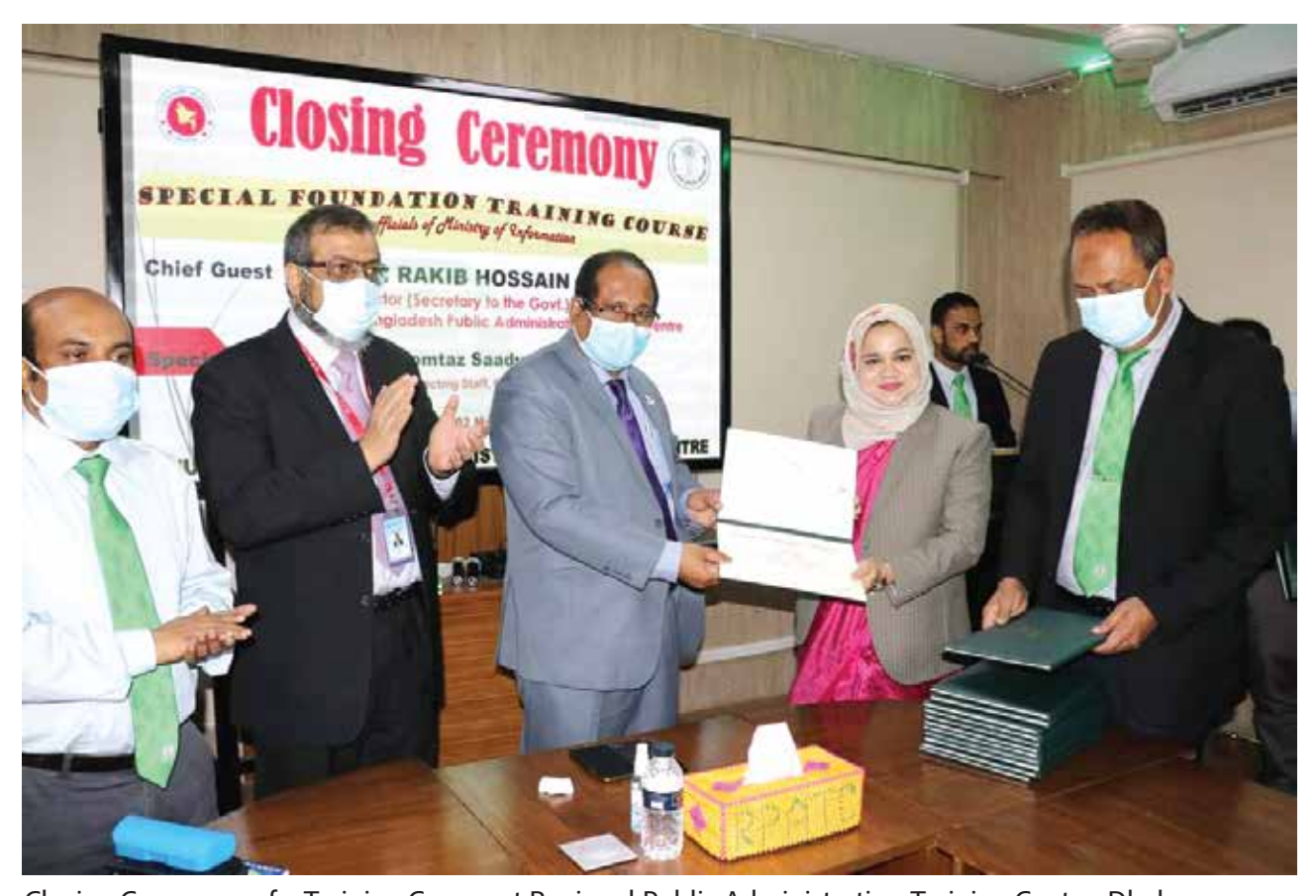
Closing Ceremony of a Training Course at Regional Public Administration Training Centre, Dhaka