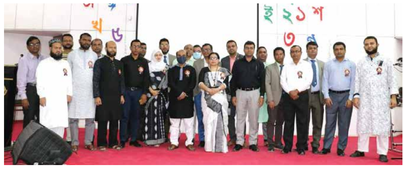
Celebration of International Mother Langue's day at Regional Public Administration Training Centre, Dhaka